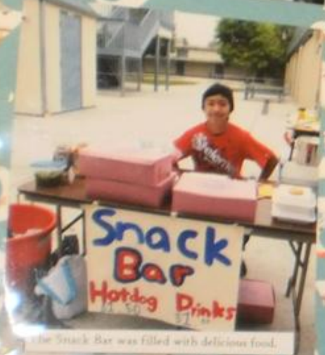
The Snack Bar was filled with delicious food.

We teamed up with Oak's L.I.F.E. (Living in Faith Everyday) Club to help raise money for the school. Together, we raised a lot of money and enjoyed while having a blast.