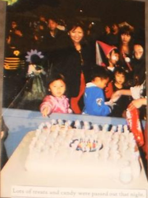
Lots of treats and candy were passed out that night.