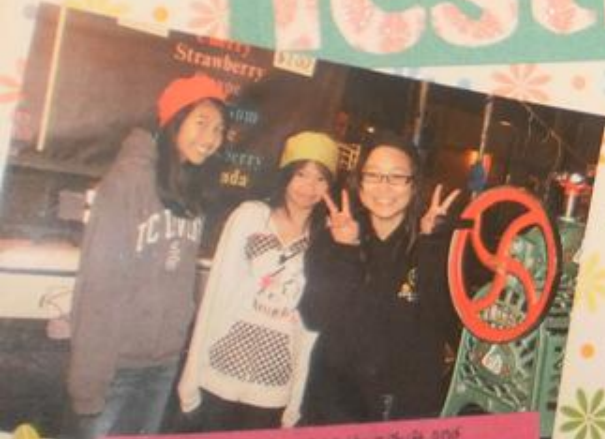
The girls just finished their shift and are about to enjoy the carnival