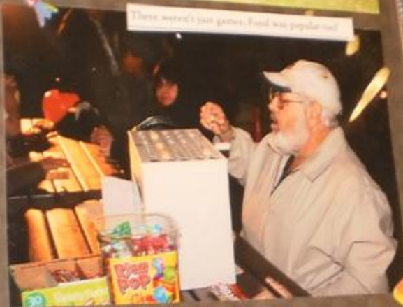
There weren't just games. Food was popular too!