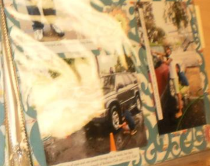
All types of people and projects are welcome here! We hope you can help us raise money for the school by donating to the L.I.F.E. Club. Thank you!