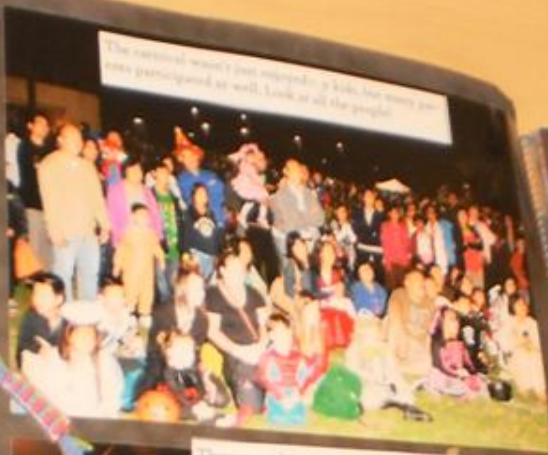
The costume wasn't just enjoyed by kids, but many of the participants as well. Look at all the people!