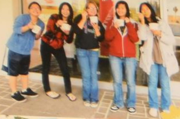
Builders Club happily eating their yogurt