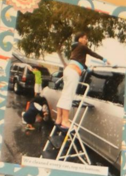
We cleaned every car, top to bottom.