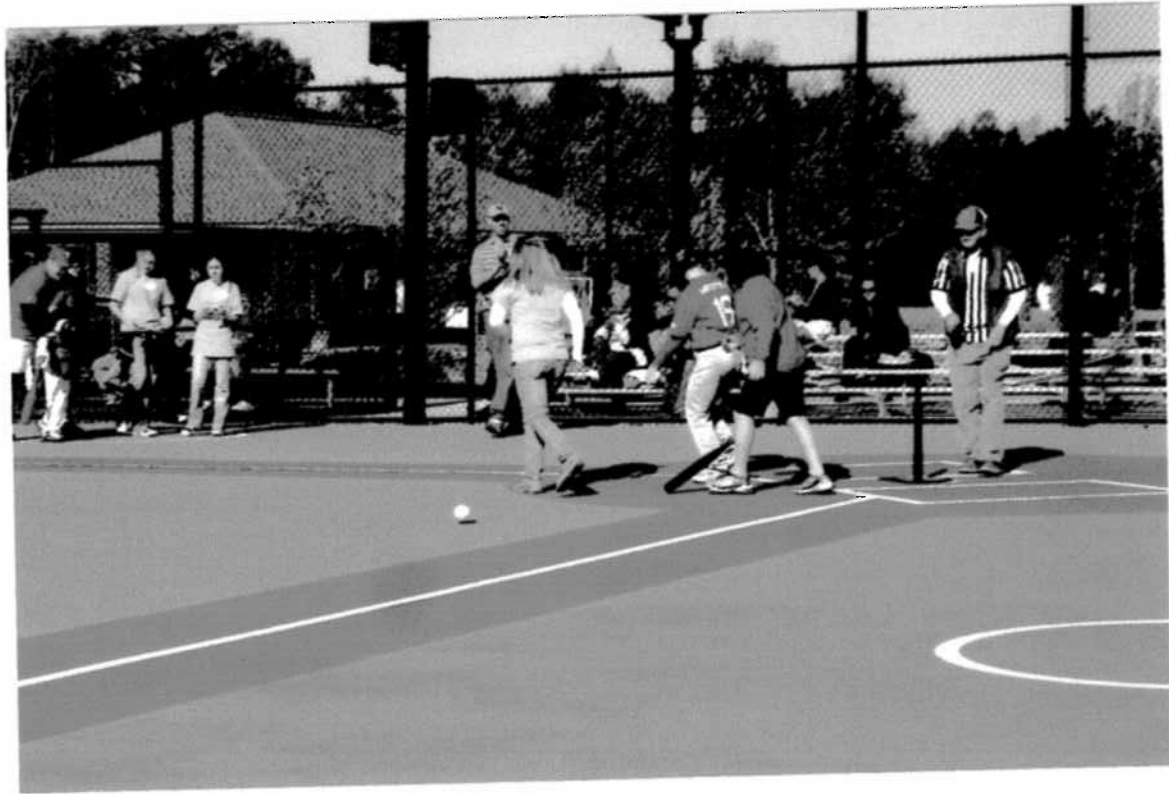
Buddies having Fun