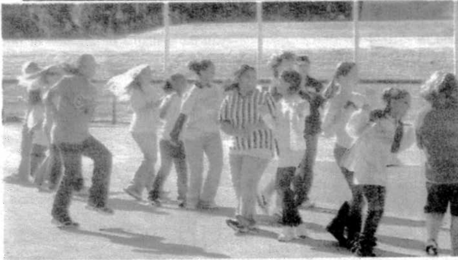
Builders Club members helped at the Miracle League baseball tournament.

I n only four years, the Builders Club of Jamestown Middle School has become a very popular club at the school and within the community. The Builders Club, under the banner of Kiwanis International, focuses on teaching leadership to middle school students through service.