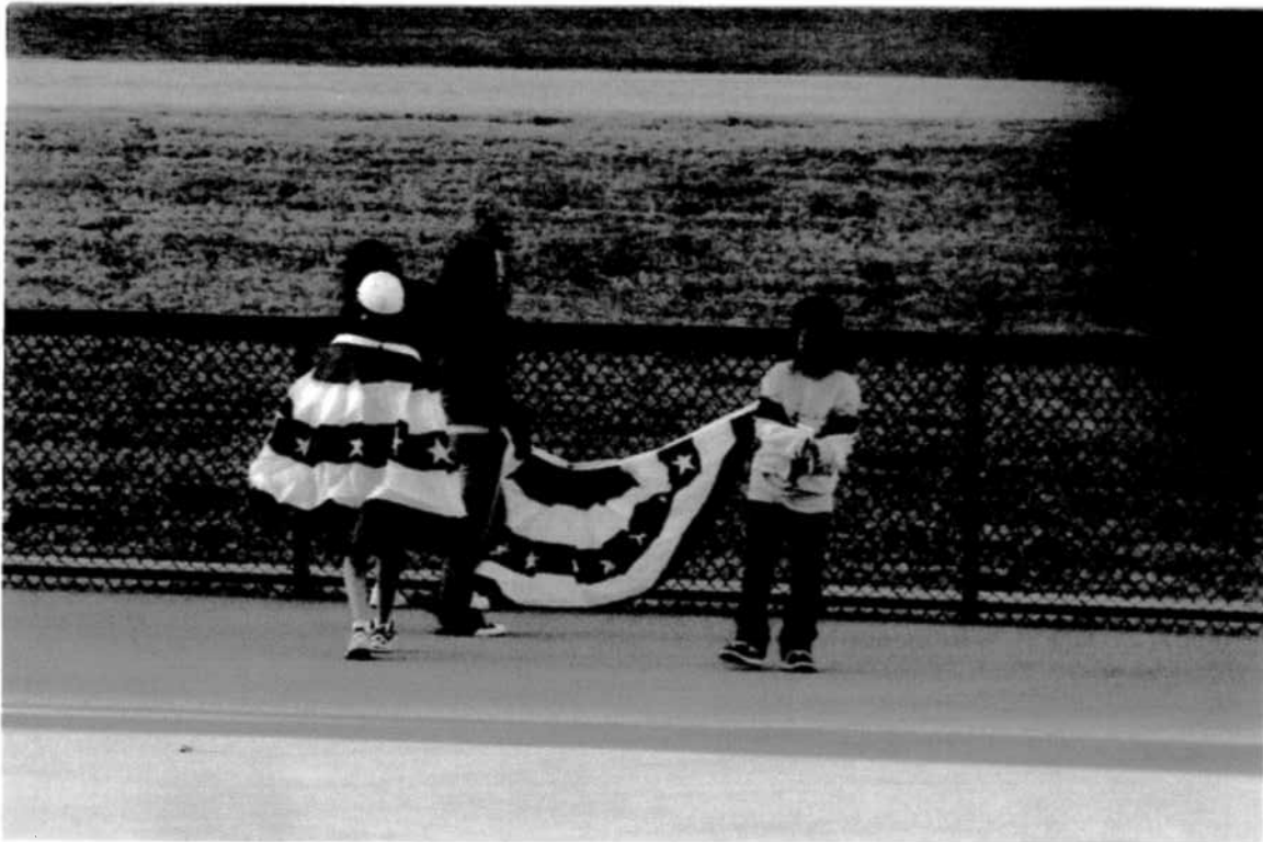
Getting the Ballfield Ready